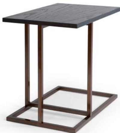
DAN2 100x92 h 33 Veneered Canaletto walnut wooden top.

Consulta i metalli Discover the metals Consultez les métaux