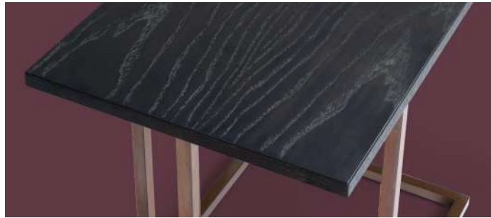
piano in legno wooden top plateau en bois