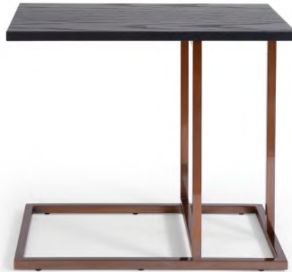
coffee table 56x37 h 50 / Veneered lacquered Grey Oak top. Brass base finish Burnished Bronze.