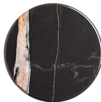
SAHARA NOIR (MA2)

Tutte le immagini sono inserite a scopo illustrativo, i colori sono puramente indicativi e possono differire dai toni reali. All images are shown for illustrative purposes, the colors are purely indicative and may differ from the real tones. Toutes les images sont présentées à titre d'illustration, les couleurs vues sur l'écran sont purement indicatives et peuvent différer des tons réels.