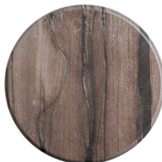
SEQUOIA BROWN (QUARTZITE) (MA3)