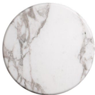
CALACATTA VAGLI ORO (MA4)