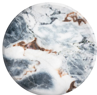
OCEAN STORM (MA4)