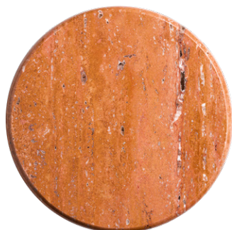
TRAVERTINO GIALLO (MA1)