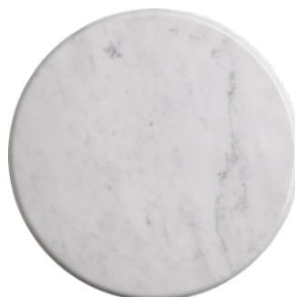
CARRARA ARABESCATO (MA1)