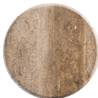
TRAVERTINO RIGATO (MA2)