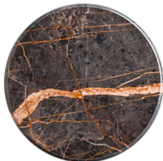
PORT LAURENT (MA2)