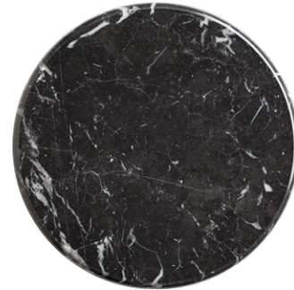
NERO MARQUINIA (MA1)