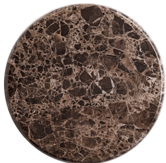
EMPERADOR DARK (MA1)