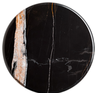
SAHARA NOIR (MA2)