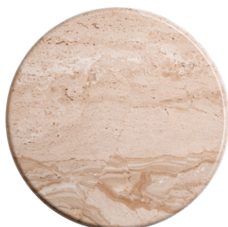
DAINO REALE (MA1)