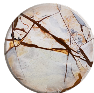
BLUE ISLAND (QUARTZITE) (MA4)