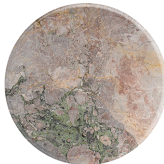
IRIS HEAVEN (MA4)