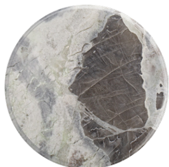
OYSTER WHITE (MA4)