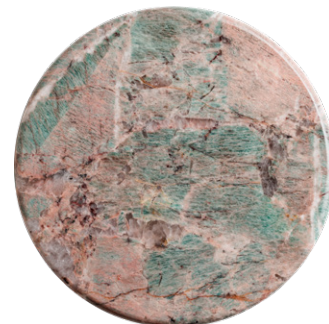
AMAZONITE EXTRA (QUARTZITE) (MA5)

Tutte le immagini sono inserite a scopo illustrativo, i colori sono puramente indicativi e possono differire dai toni reali. All images are shown for illustrative purposes, the colors are purely indicative and may differ from the real tones. Toutes les images sont présentées à titre d'illustration, les couleurs vues sur l'écran sont purement indicatives et peuvent différer des tons réels.