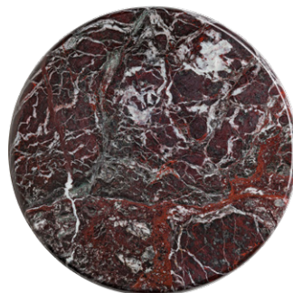
ROSSO LEVANTO (MA2)